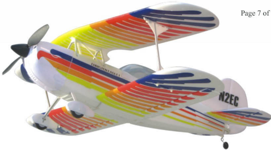
This picture only for reference!