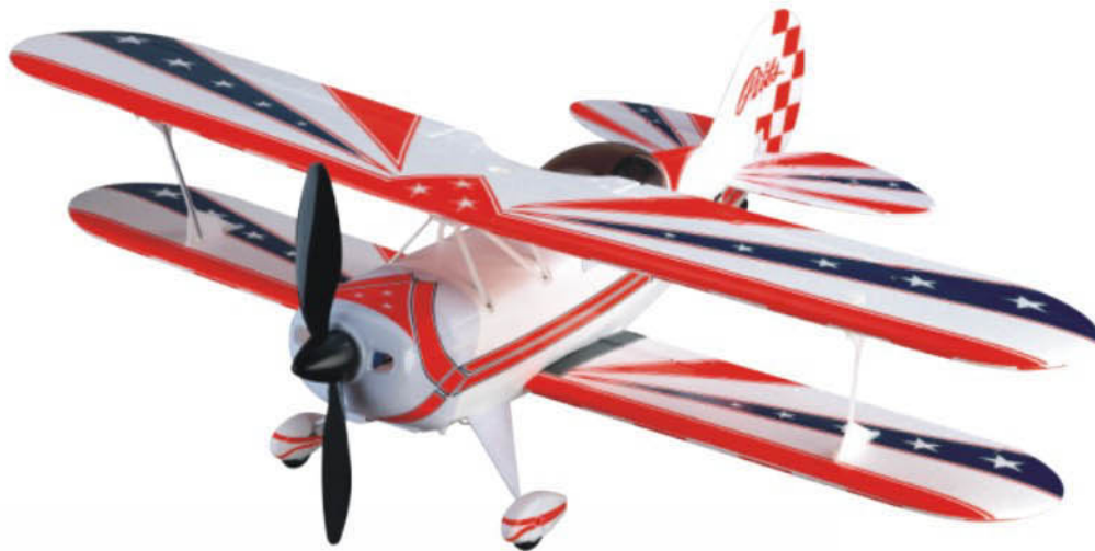
This picture only for reference!